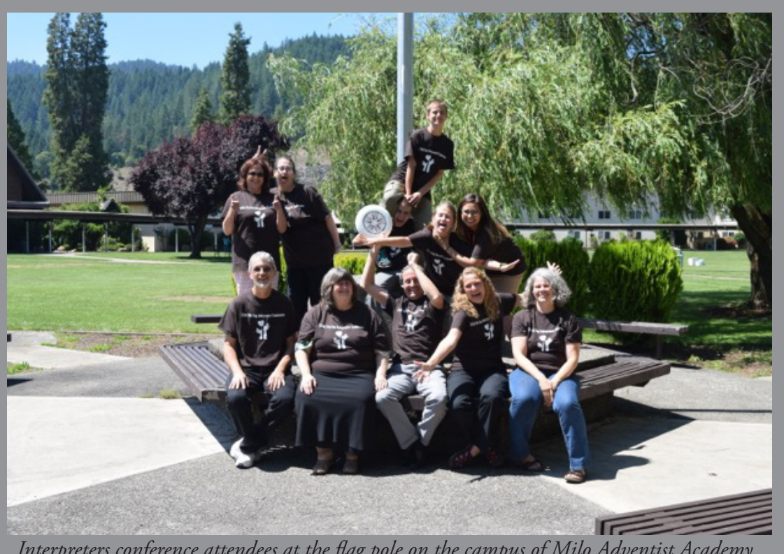
Interpreters conference attendees at the flag pole on the campus of Milo Adventist Academy in July.

struggles. We were blessed with deaf participation that helped to guide our conversation. All left the conversation having felt richly blessed by sharing.